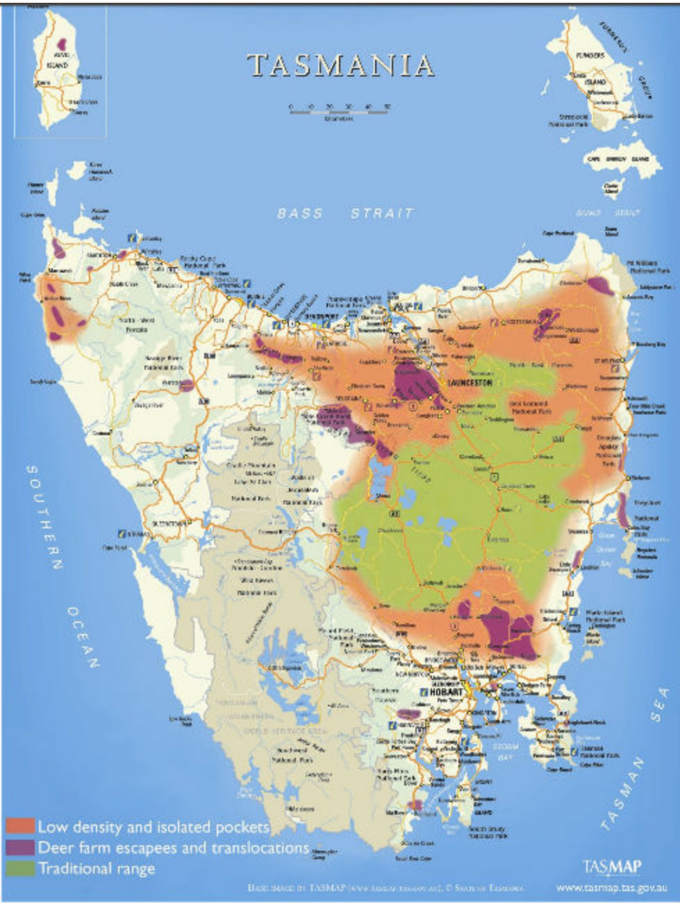
Figure 1: Distribution of fallow deer in Tasmania

The worldwide distribution of the fallow deer includes some areas similar in climate to Tasmania. The Climate matching software (BRS 2011) calculated 24 grid squares with a score of 7 or 8, which suggests these areas have a highly suitable climate for the fallow deer. The remaining 6 grids have scores of 4 to 6 and the climate in these areas would also be considered suitable. These scores were obtained using the Bomford risk assessment model (2008) which has been modified by DPIPWE for assessments in Tasmania (DPIPWE 2011a). A Climatch score of eight indicates that there is a moderate to high risk of this species becoming established in Tasmania, and in fact there are already established feral populations in Tasmania (Figure 1).